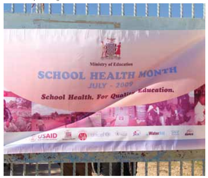
Step 6. Help the ministry of education through external assistance (e.g., consultants, projects, health-related NGOs) identify school health activities that will excite the community. Be innovative and inclusive in design.

Ministry of education personnel have been quoted as saying that while other interventions to improve educational quality target teachers, books, or administration, school health actually targets the child directly. Whereas teacher training results in a teacher who is more engaging and effective in the classroom, school health interventions can actually produce a more energetic and attentive student—almost instantly. Such observations by teachers and community members about the benefits of school health excite and energize people about education, and about school health. These attitudes are important for increasing the support and involvement of all in the design and implementation of school health programs.