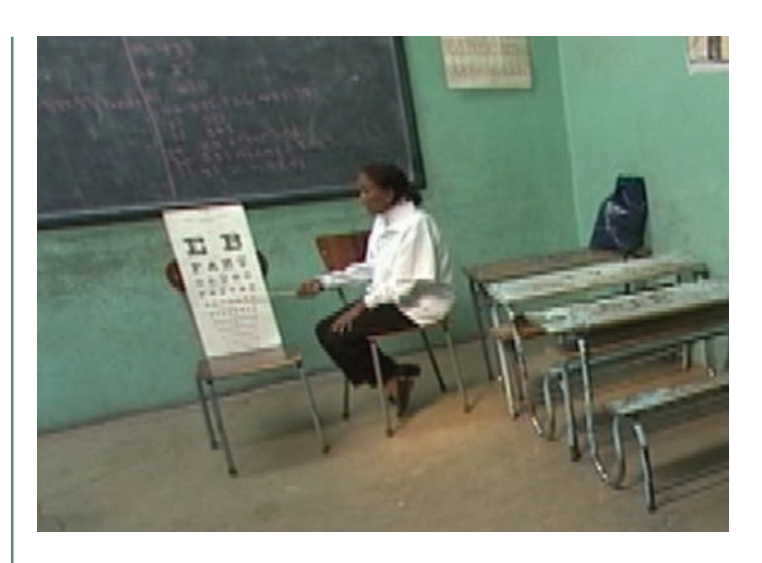
Vision testing in Eritrea

The conference resolutions have been embodied in 'The Declaration of the Oxford 2007 International Conference on Vision for Children in the Developing World' (see box below) and pave the way for immediate action to redress the problem of uncorrected vision in children in the developing world. A core group of participants have taken the resolutions of the conference forward, establishing a global research team, to oversee a 'Child Self-Refraction Study', due to start mid-2008. The results of the study will inform the development of plans to operationalise scaled delivery of eyeglasses in countries throughout the developing world providing a new way forward to meeting the challenges of 'Education for All' and the 'Millennium Development Goals'.