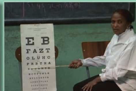
Vision testing in Eritrea

Report from a conference of international child vision experts, development specialists and low-income country government representatives held at Wolfson College, University of Oxford, 25th-27th July, 2007